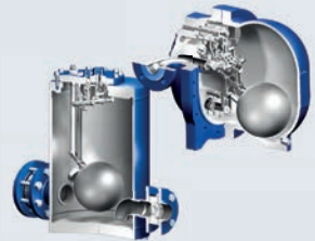
Mechanical pump systems CONLIFT®, CONA® P