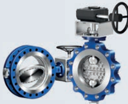
Process Valves ZETRIX® High Performance-Valves ZEDOX®