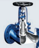
Bellows sealed valves FABA® Plus, FABA® Supra I/C