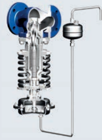
Control without auxiliary power PREDU® / PREDEX® / PRESO® / TEMPTRON®