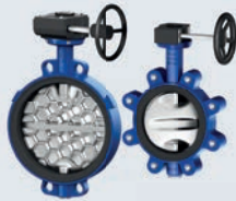
Butterfly valves ZESA®/GESA®