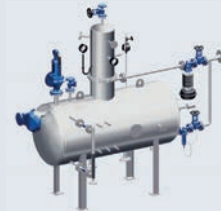
Feedwater tank with deaerator dome