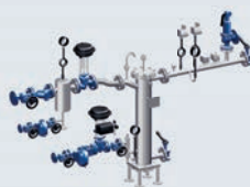
Heat exchanger ENCOsys®