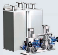
Condensate return system CORsys®