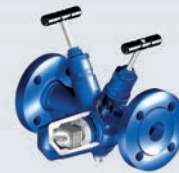
Steam traps with multi- valving technology CONA® "All-in-One" (incl. stop valve, inside strainer, back-flow protection, drain valve)