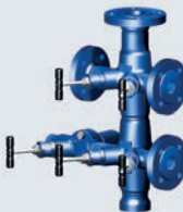
Manifolds CODI® for collecting and diverting purpose