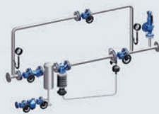
Pressure reducing station PREsys®