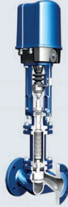
STEVI® Smart (BR 423/463, 425/426, 440/441, 450/451)