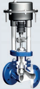
STEVI® Vario (BR 448/449)