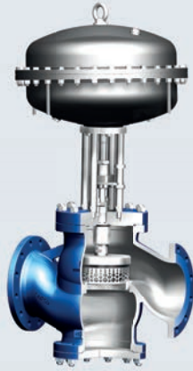
Control valves STEVI® Pro (BR 422/462, 470/471)